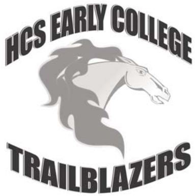
HCS Early College High School